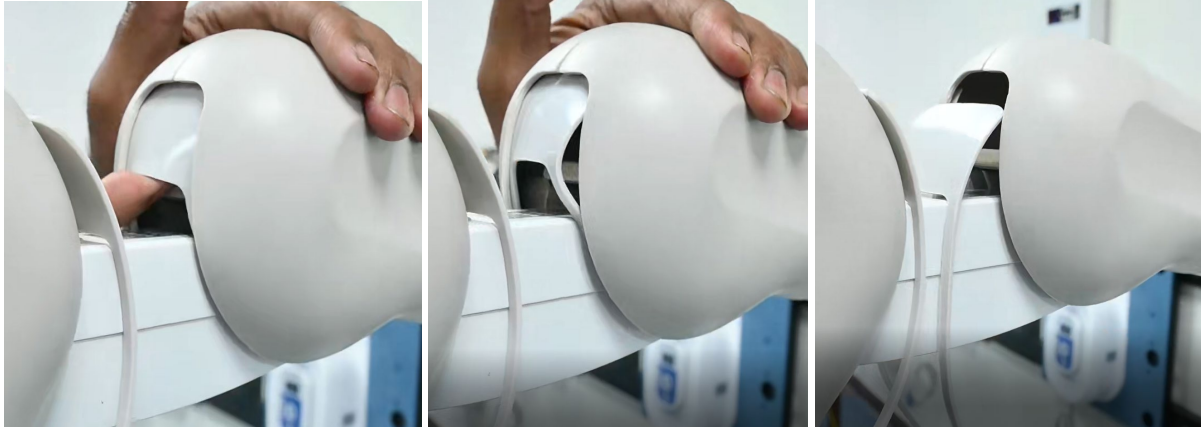
Remove old elbow covers

To replace the plastic elbow covers, the rubber slot cover must first be pulled out. To do this, simply use your finger to extract this.